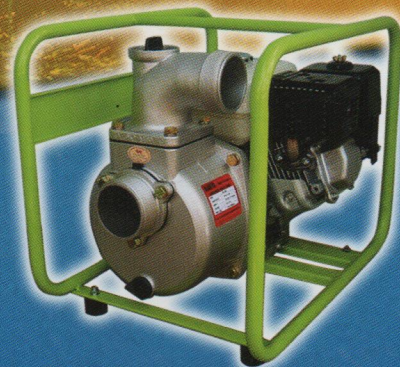
▲ Mdl : GA40H/50H/80H with frame