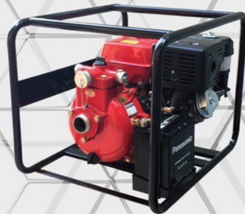
High Pressure Self-Priming Centrifugal Pump